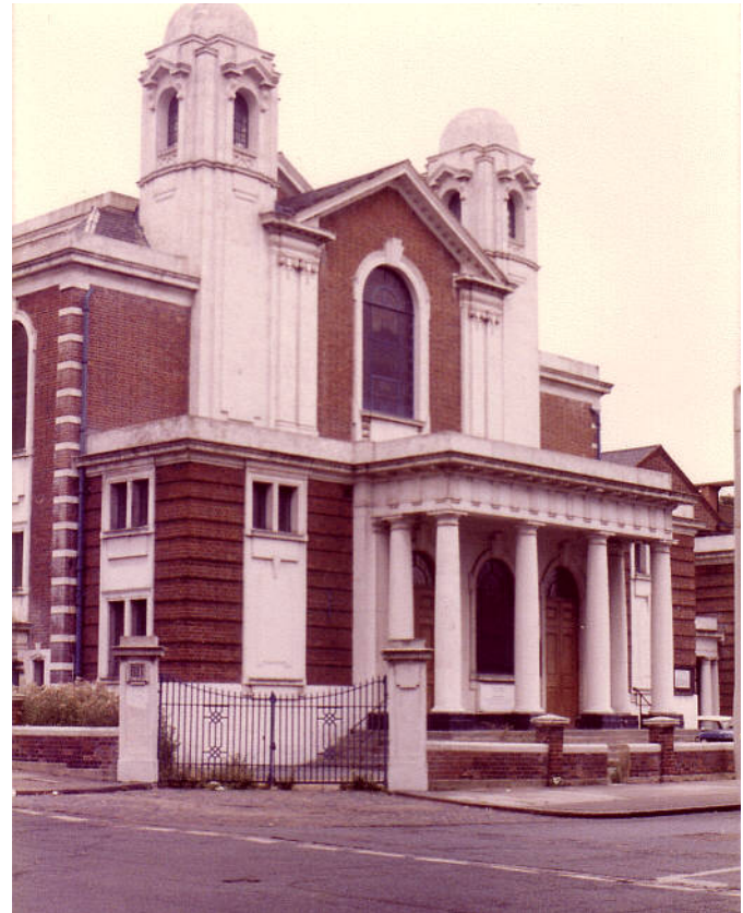
Stamford Hill, London