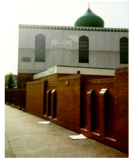
Jamia Mosque in Derby England