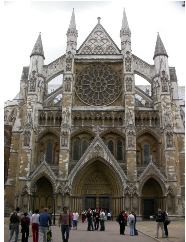
Westminster Abbey London