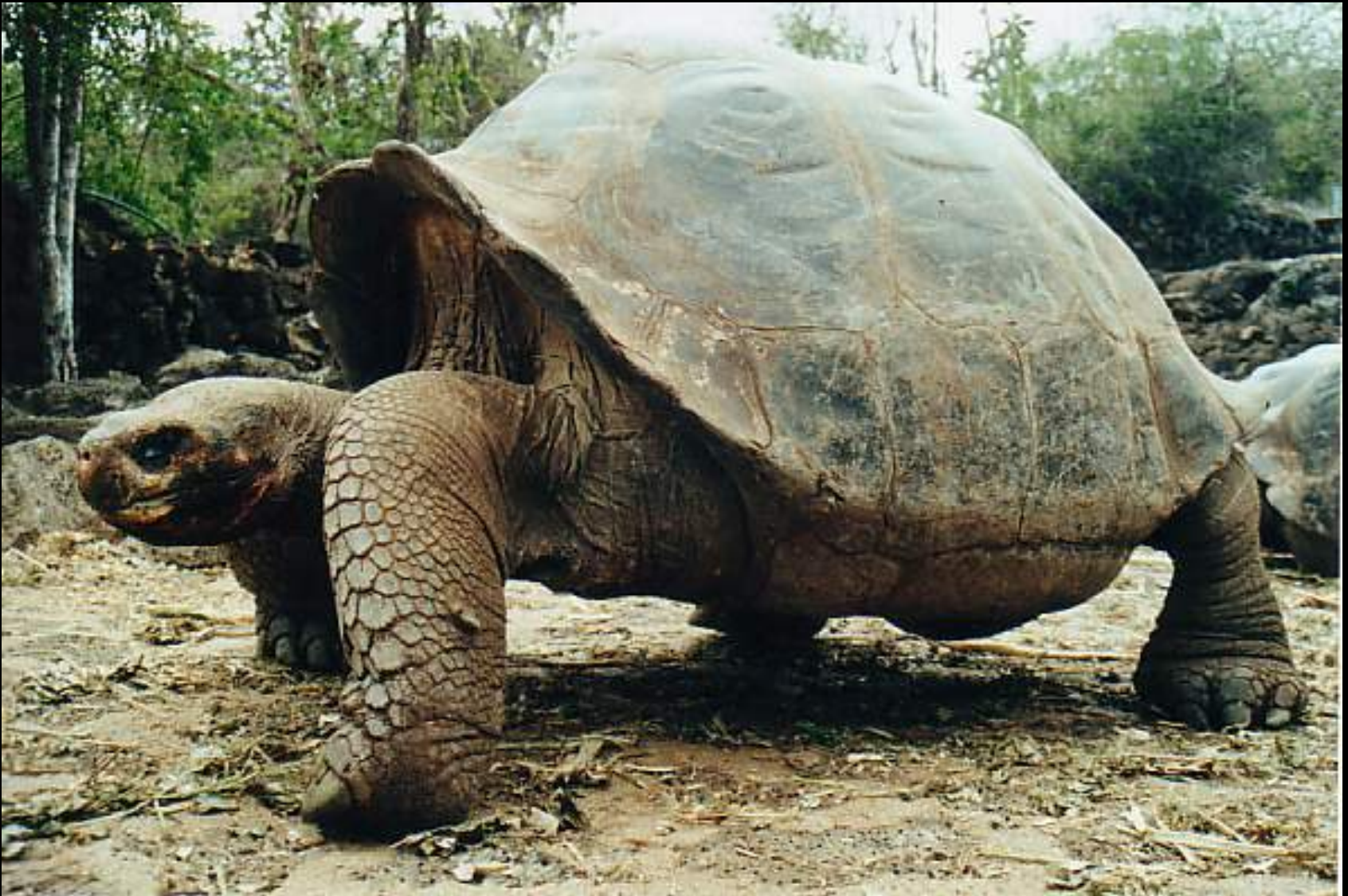
Galapagos Islands, Ecuador