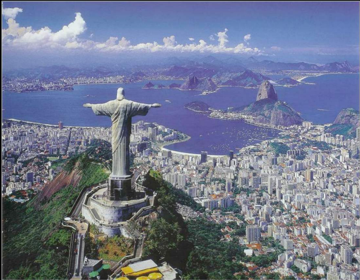
Rio de Janeiro, Brazil