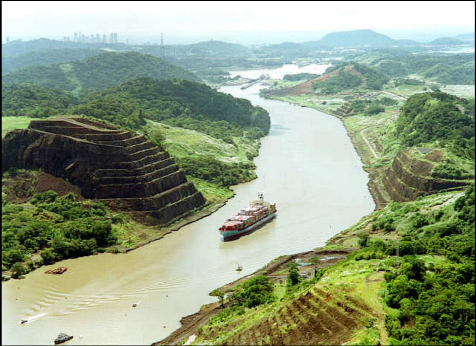
Panama Canal, Panama