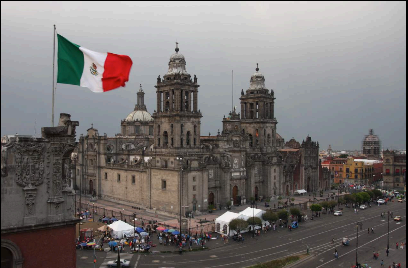
Metropolitan Cathedral, Mexico City, Mexico