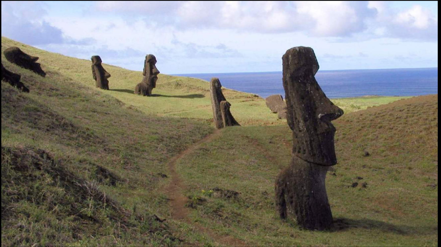
Easter Island, Chile