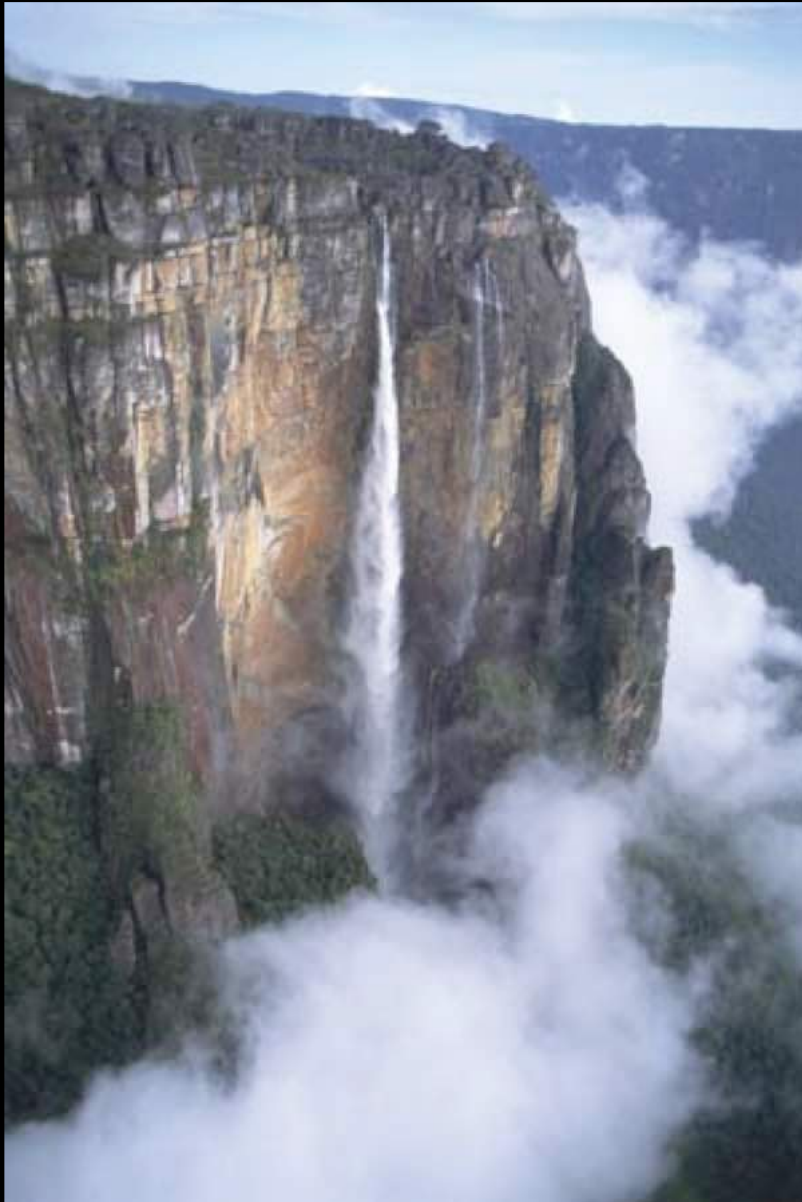
Angel Falls, Venezuela