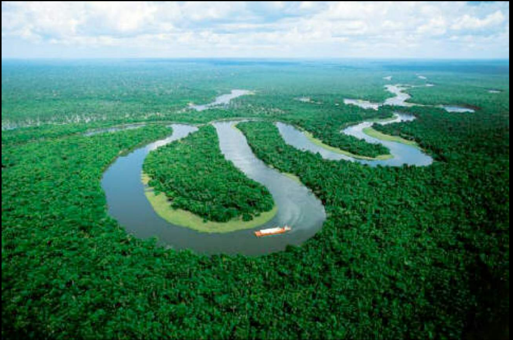
Amazon, South America