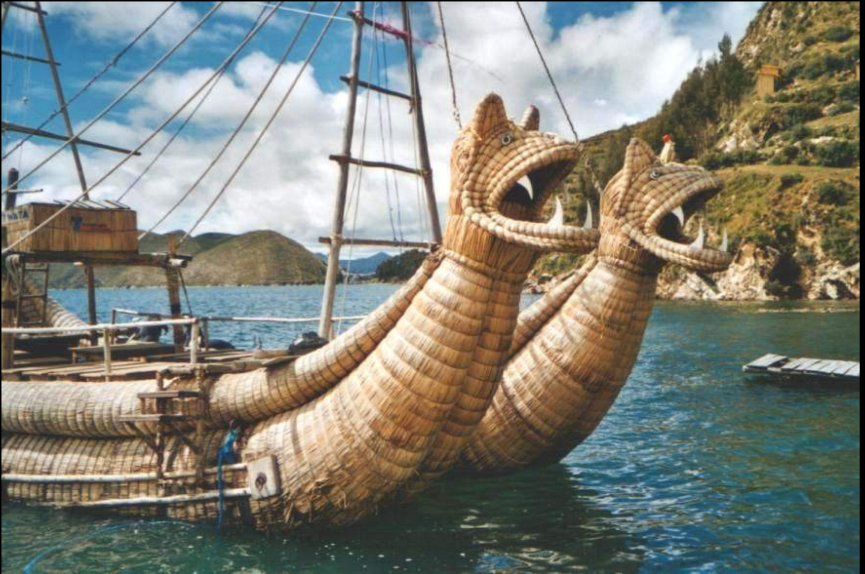
Lake Titicaca, Bolivia/Peru