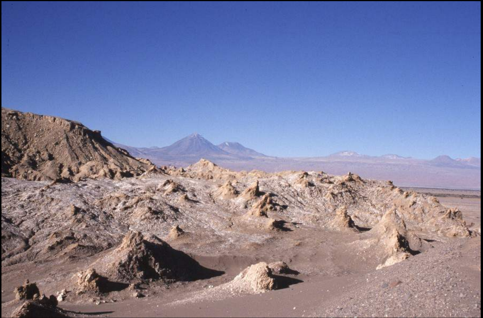
Atacama Desert, Chile