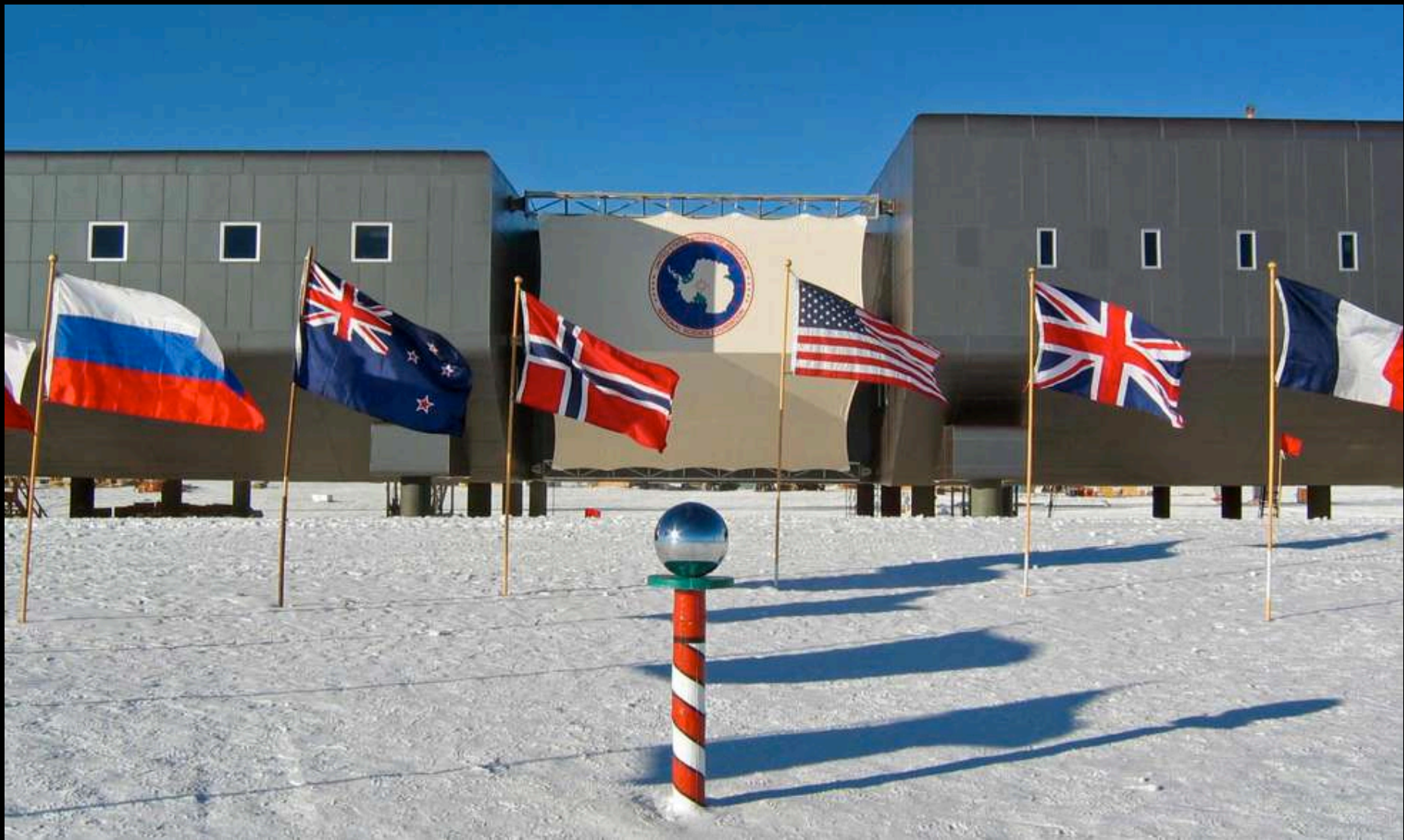
Amundson/Scott South Pole Station, Antarctica