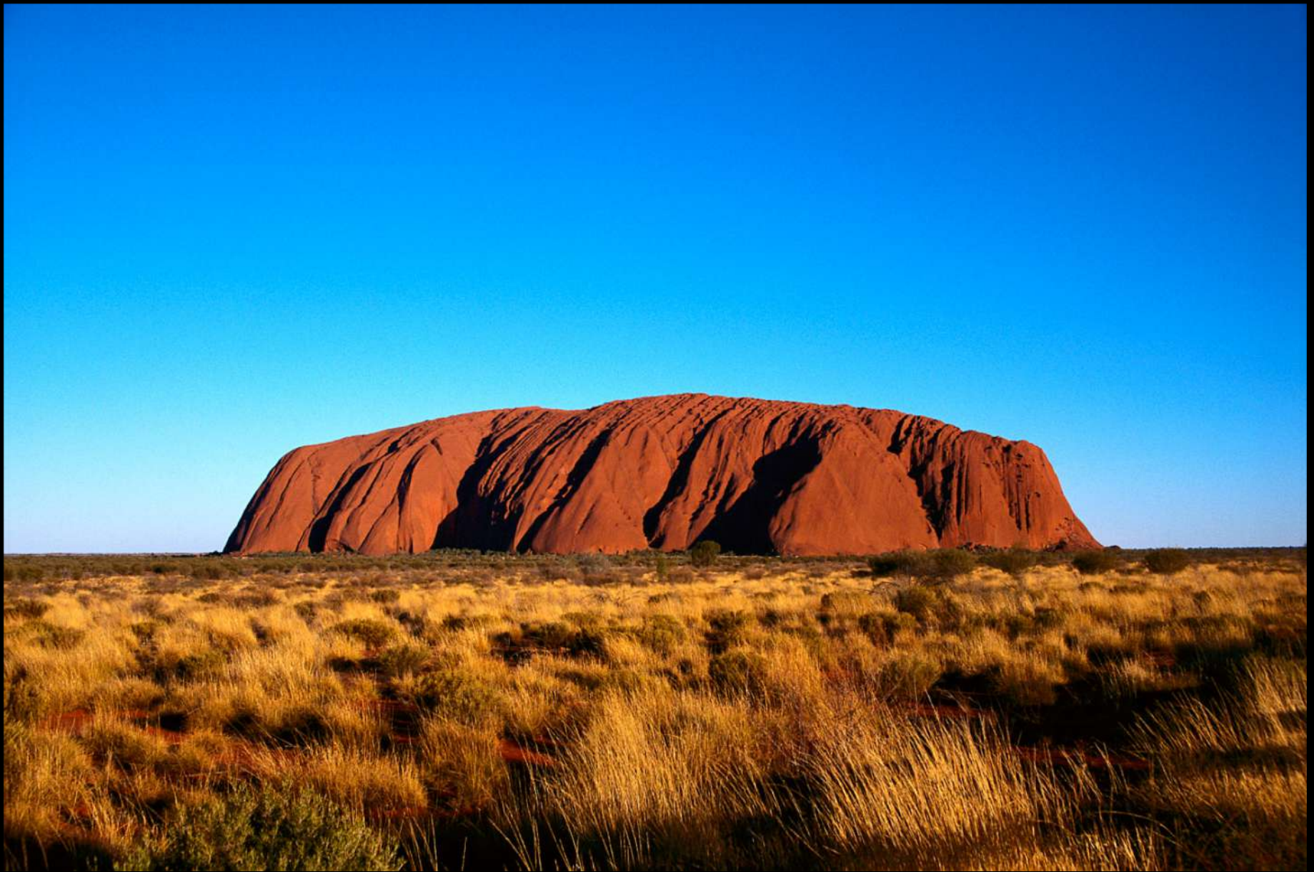
Ayers Rock, Australia