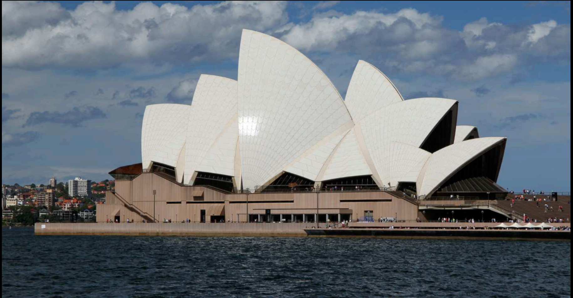
Sydney Opera House, Sydney, Australia