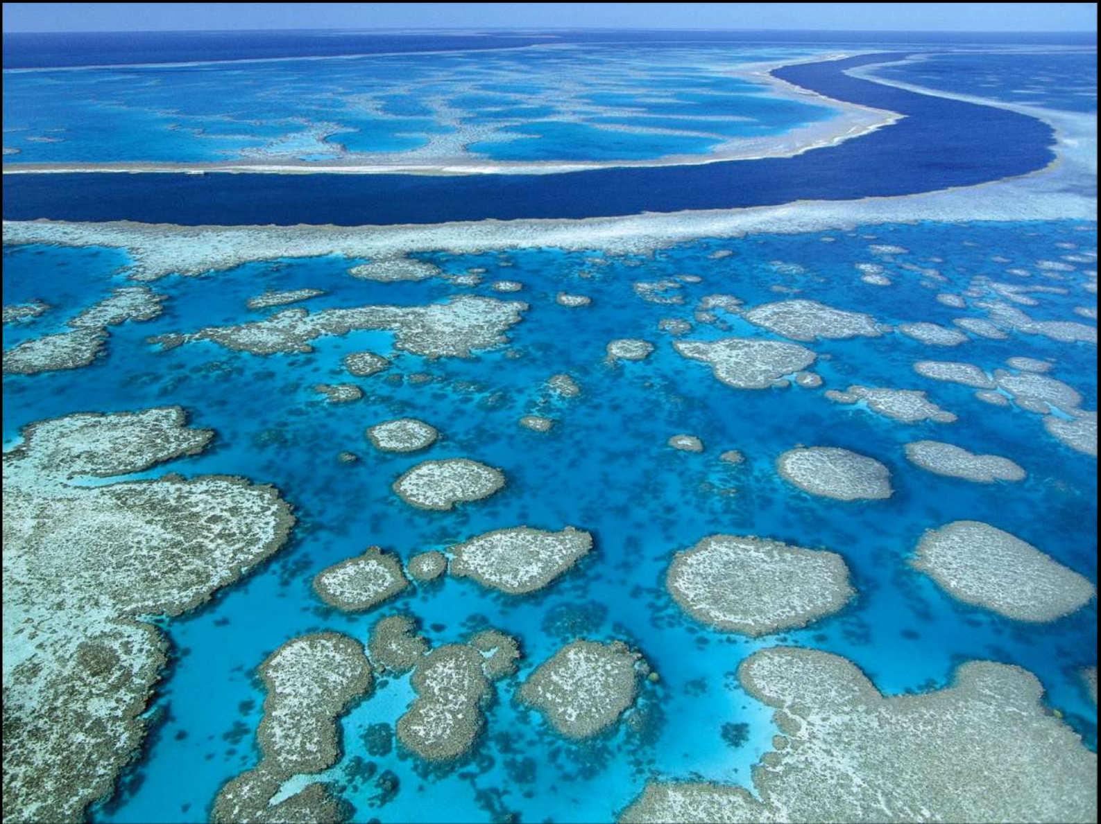
Great Barrier Reef, Australia