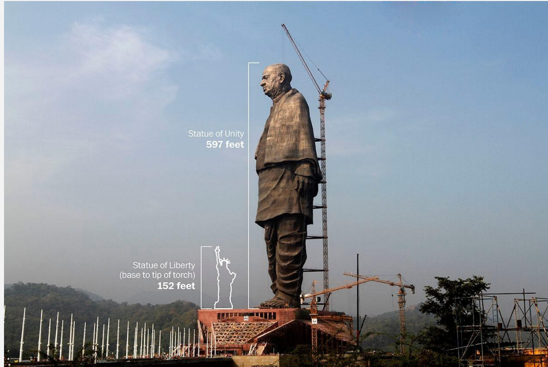
Pictured Above - Statue of Unity: colossal statue of Indian statesman and independence activist Sardar Vallabhbhai Patel (1875–1950) and located in the state of Gujarat, India. It is the world's tallest statue with a height of 182 metres (597 ft).